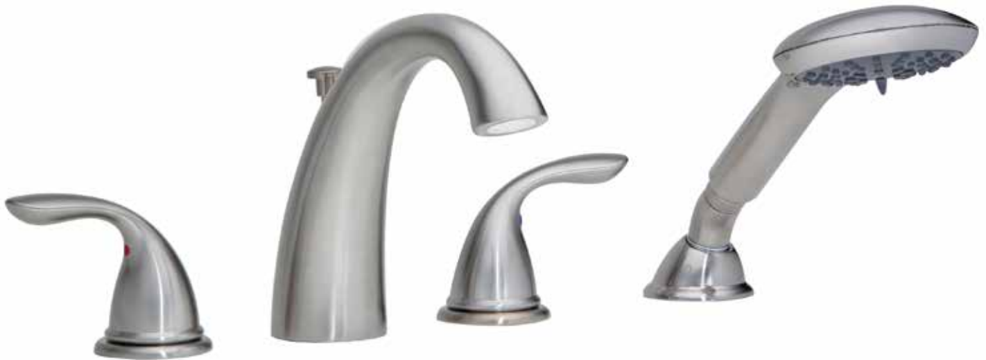
PVD SATIN NICKEL

06-4089HS / 06-4089HSSN ROMAN TUB FAUCET