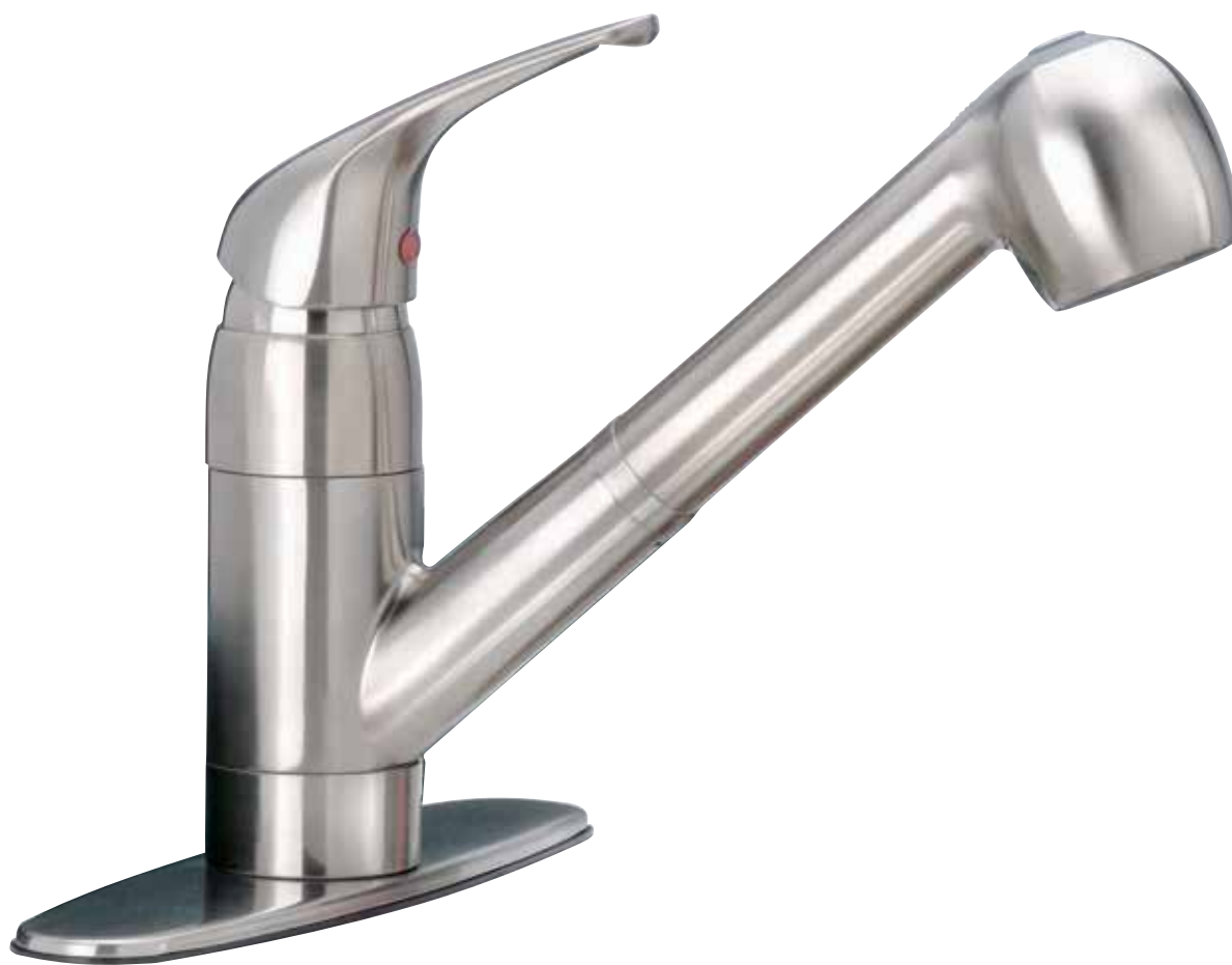
PVD SATIN NICKEL