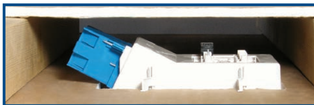
Top view showing ample room between drywall and studs.