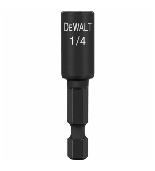
Rollover image to zoom