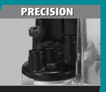
Plunge depth adjustment lever with three preset depth stops

0" - 1-3/8" plunge depth capacity for easy penetration into work piece